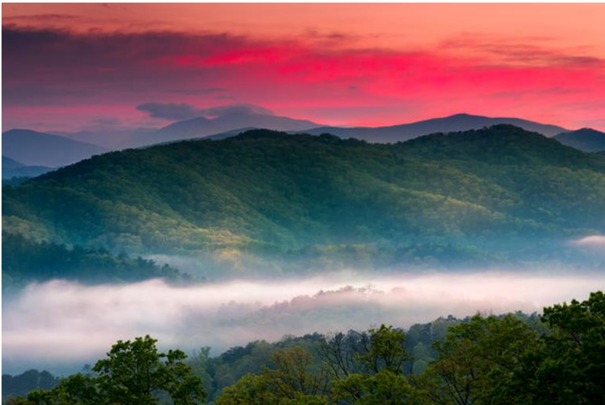
Great Smoky Mountains National Park (one of the only National Parks with no admission fee)