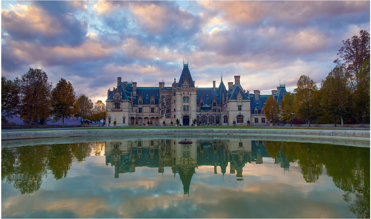
The Famous Biltmore Estate, America's Largest Home (admission fee)