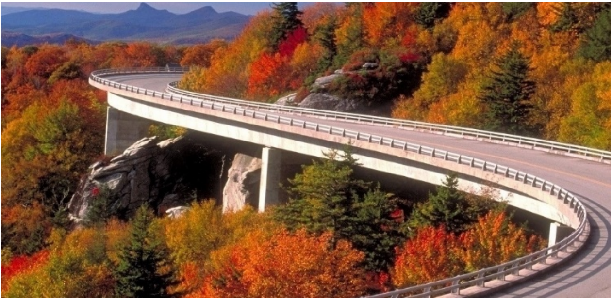
Travel Along The Beautiful Blue Ridge Parkway (free)